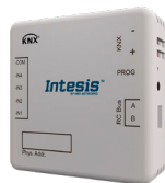
INKNXHIS001R000 VRF Systems 1 I.U. with Binary Inputs