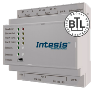
INBACHISXXXO000 VRF Systems 16/64 Indoor Units