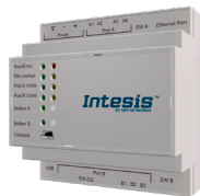
INMBSHISXXXO000 VRF Systems 16/64 Indoor Units