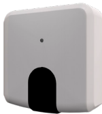
INKNXUNIO01I000 Universal Infrared AC 1 I.U. with Binary Inputs